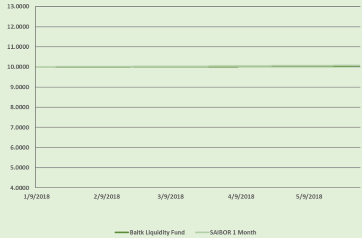
Baitk Liquidity fund investments - Asset Class